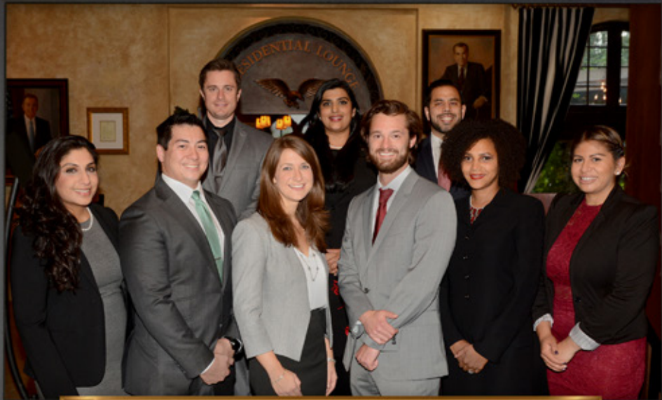
BARRISTERS Board 2018-2019