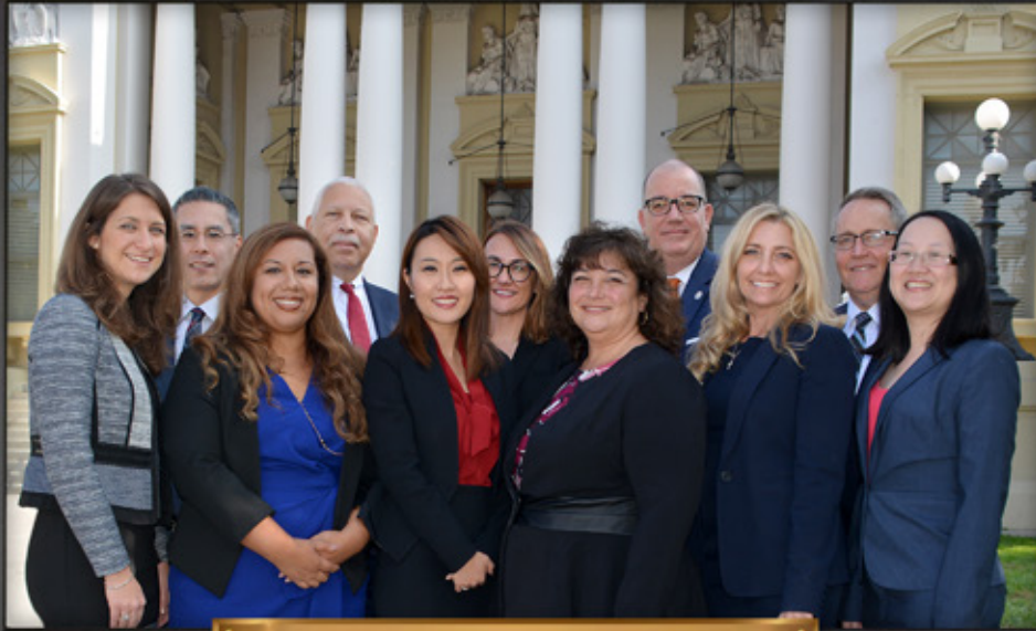
RCBA Board 2018-2019